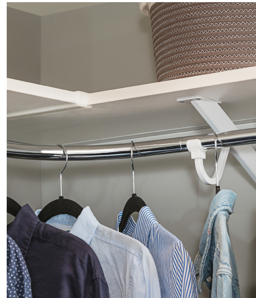
TOP: EXPRESS SHELF MELAMINE SHELVING IN WHITE