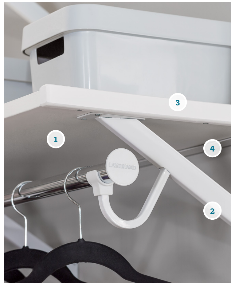
LEFT: EXPRESSSHELF MELAMINE SHELVING IN WHITE MIDDLE: EXPRESSSHELF MELAMINE SHELVING IN WHITE RIGHT: EXPRESSSHELF WITH MELAMINE SHELVING IN DEEP BRUNETTE.