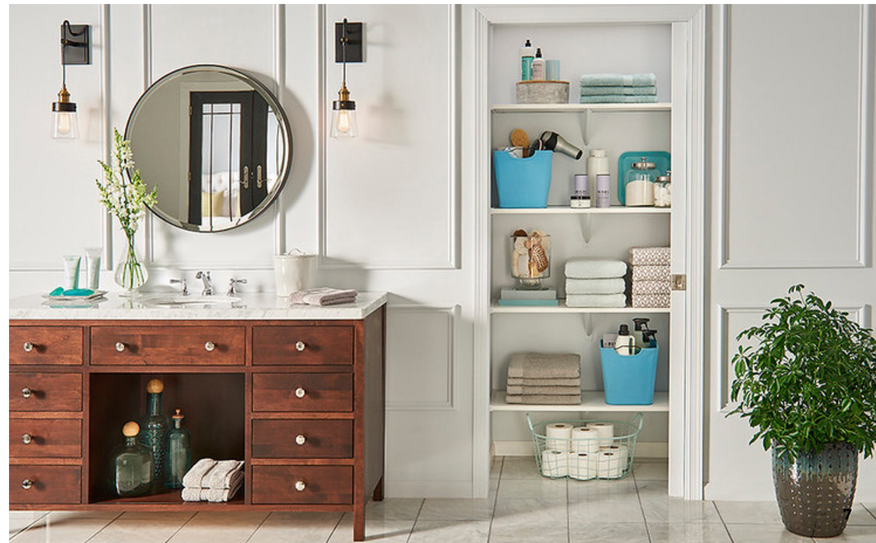
TOP RIGHT: EXPRESS SHELF MELAMINE SHELVING IN WHITE BOTTOM RIGHT: EXPRESSSHELF MELAMINE SHELVING IN WHITE LEFT CENTER: EXPRESSSHELF MELAMINE SHELVING IN WHITE LEFT BOTTOM: EXPRESSSHELF MELAMINE SHELVING IN WHITE