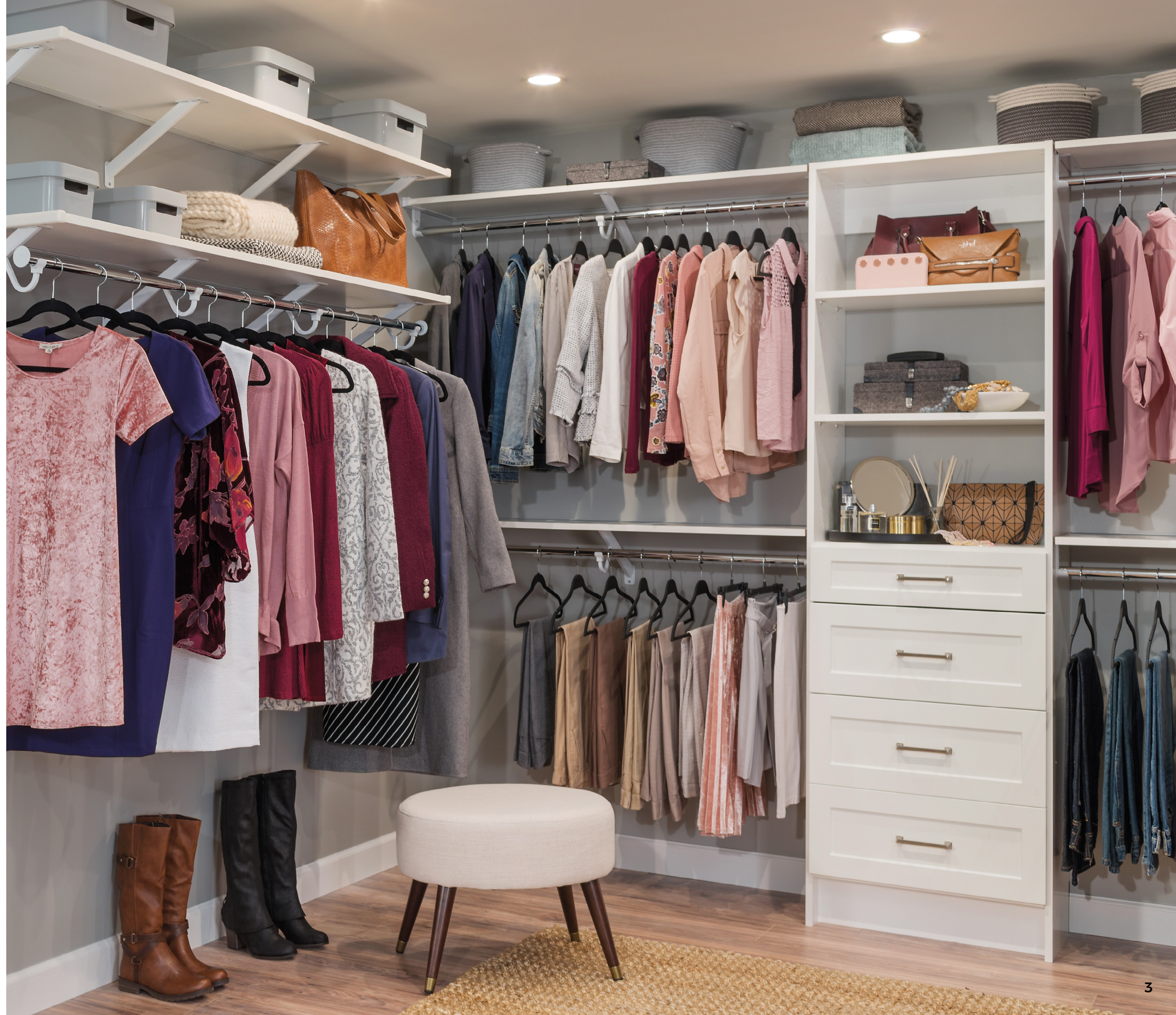
RIGHT: EXPRESSSHELF WITH MATERSUITE CLASSIC IN WHITE

Consistent fit. Quality design. Quick install. ExpressShelf, the system for builders.