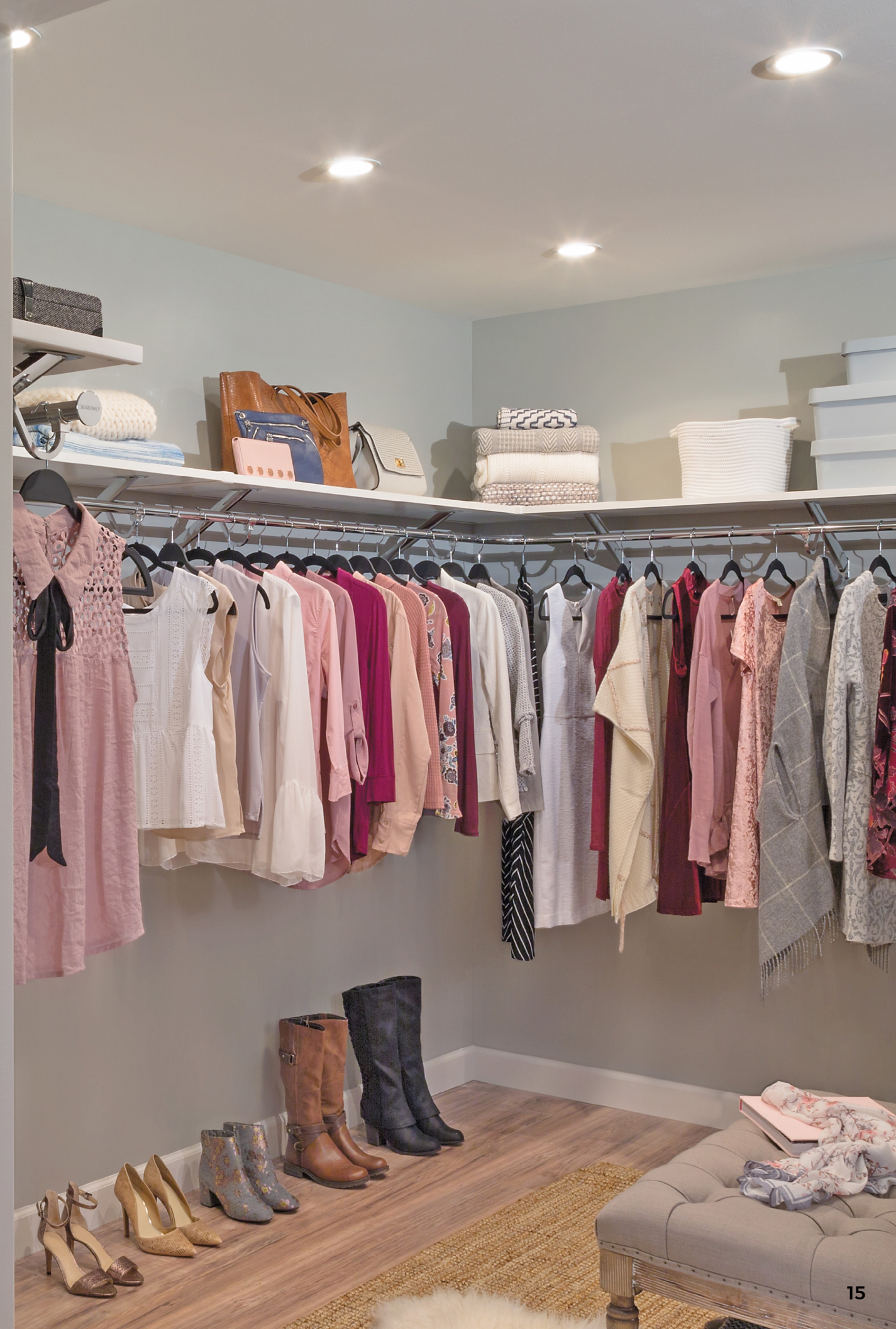
RIGHT: EXPRESSSHELF MELAMINE SHELVING IN WHITE

For design services and assistance, email your request to: design@ames.com